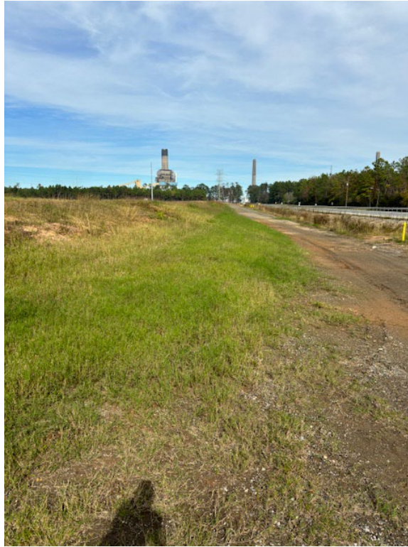
Photo 1, Southeast east corner, looking North.