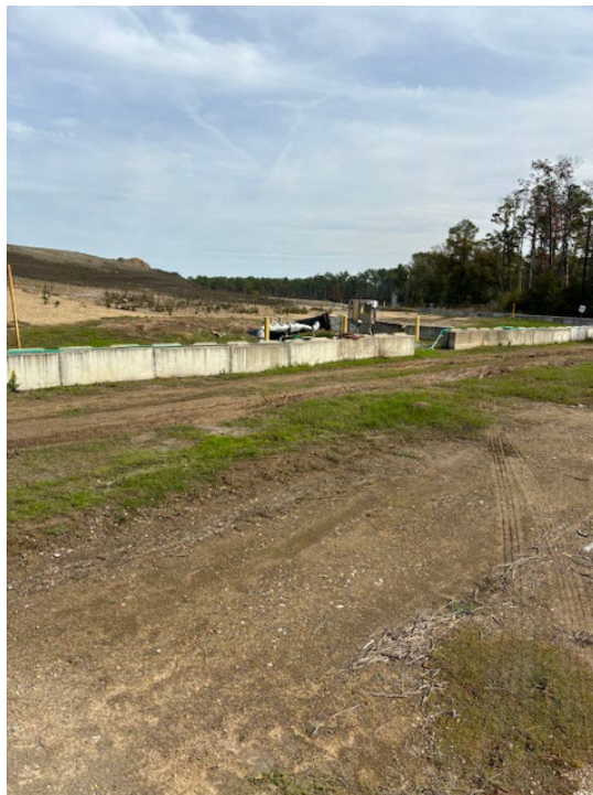
Photo 4 , Southwest corner, looking East.