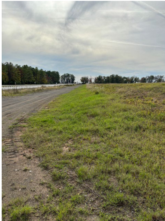
Photo 11, Northeast Corner, looking South